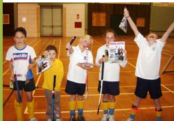
The winners of the youth week skills and tricks competition, as you can see the competition meant a lot to them – especially the overjoyed boy on the right.