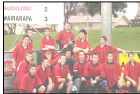
Wairarapa U18 Boys

Other outstanding results included the U11 Girls winning their major tournament and the U18 Boys winning the 2008 National Under 18 Boys Championship Tournament.