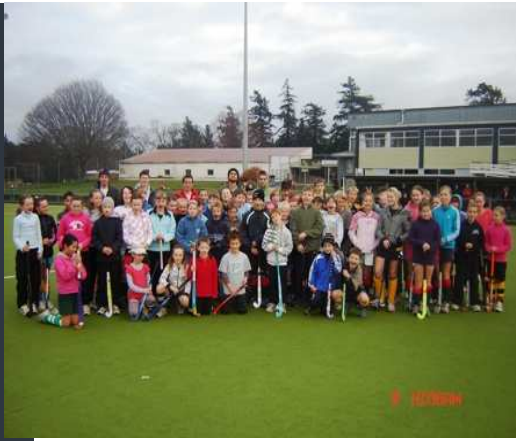
The Hockey Wairarapa Holiday Programme group from 2009, there are even more registered this year!

Both the Blacksticks men's and Women's teams are going to be very busy for the second half of the year. Both teams are competing in the Commonwealth games and Champions trophies and the men's team are also competing in a 4 nations tournament in England and the Women's the World Cup. A lot of these games are being broadcast on sky TV so keep an eye out and make sure to watch our countries finest.