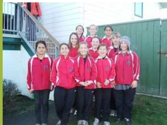
The 2009 U-11 girls' team that won the lower north island tournament. This year's side has all the makings of being just as successful.