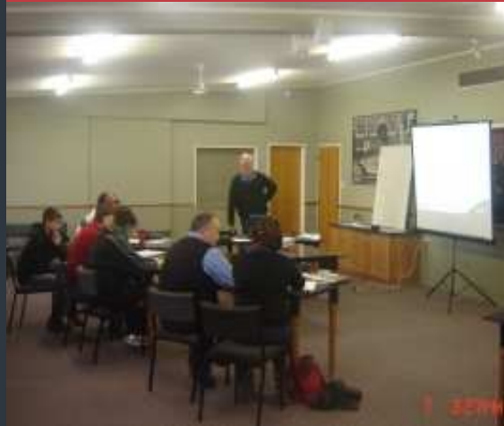
The coaches at the Small Sticks coaching course working through one of the scenarios with presenter Doug Bracewell watching on.

The coaches were shown proper techniques for various Hockey skills and worked through scenarios surrounding athlete development, the coaching process and how to structure practises.