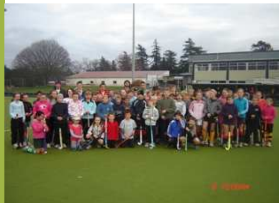
Players and coaches enjoy an early morning photo before day two of the Hockey Wairarapa Holiday Programme.

Primary 6 & 8 aside hockey begins again this weekend after a break for the holidays. Please keep your results coming in!!