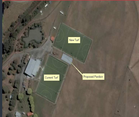
An image showing where the new Turf and Pavilion will go in relation to the existing Turf.

The second rule change is that you can no longer play the ball directly into the circle from a free hit inside the twenty-five yard area. This rule has been introduced for safety reasons and will stop players like Hayden Shaw banging the ball into the circle looking for a foot and a penalty corner.