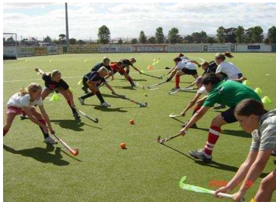
Several talented young Wairarapa players contesting the ball during one of the sessions at the Scorching Summer Clinic