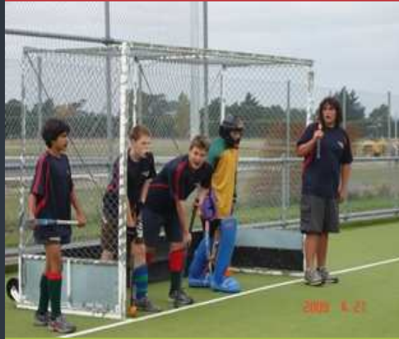
The English team set up for a penalty corner against Germany in the world cup at the Cream of the Crop coaching clinic.