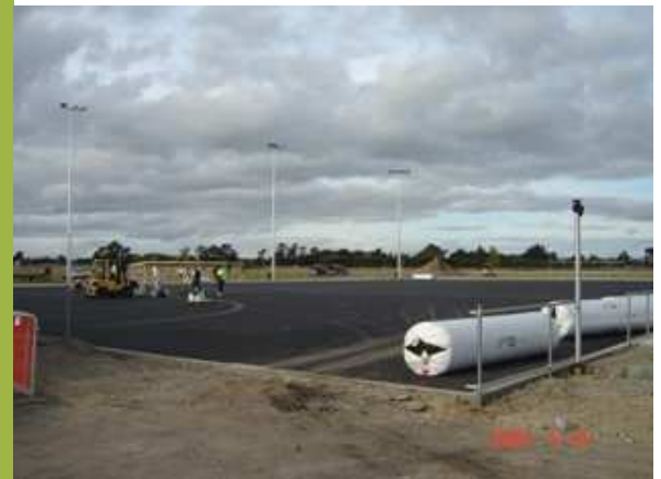
The turf just about to be laid and the new dugouts going up in the background